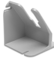
Mountable Desktop Stand P/N: 7-0393