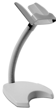
Gooseneck Tabletop Stand P/N: 8-0591